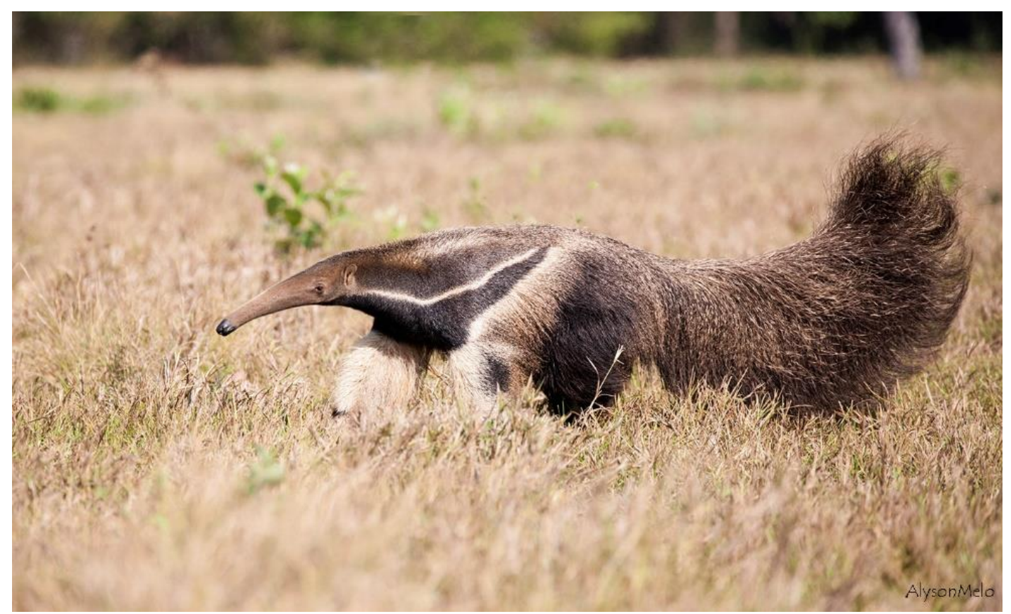
Another great Giant Anteater sighting! This time with the whole group together.

the world, the imposing Jabiru . We saw many pairs of these impressive birds stalking the ponds in search of fish, while others were flying around and collecting nesting material. Besides, we had Pantanal Caimans , Whistling Herons , Striated Heron , Wattled Jacanas , Yellow-collared Macaws , Roadside Hawk , Pampas Deer and Seven-banded Armadillo . Because 3 of the guests had missed their inbound flight and only reached the lodge late the previous night, we needed to find a good Giant Anteater, and after some searching we got it. The whole group hopped out of the truck and we worked with the accommodating anteater, shooting it in different terrain and backgrounds as it foraged, oblivious to our presence.