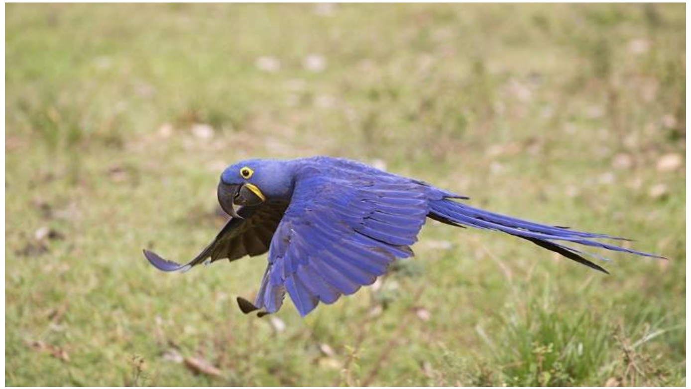
Our first Hyacinth Macaws of the trip showed en route to Aguapé

To our surprise we had yet another outstanding Giant Anteater sighting; we were returning to the van after getting some great images when we sighted a Lesser Anteater ( Tamandua ) that sent us back to the field to photograph one of the most difficult mammals to see during day time and on the ground no less, as they are mainly arboreal.