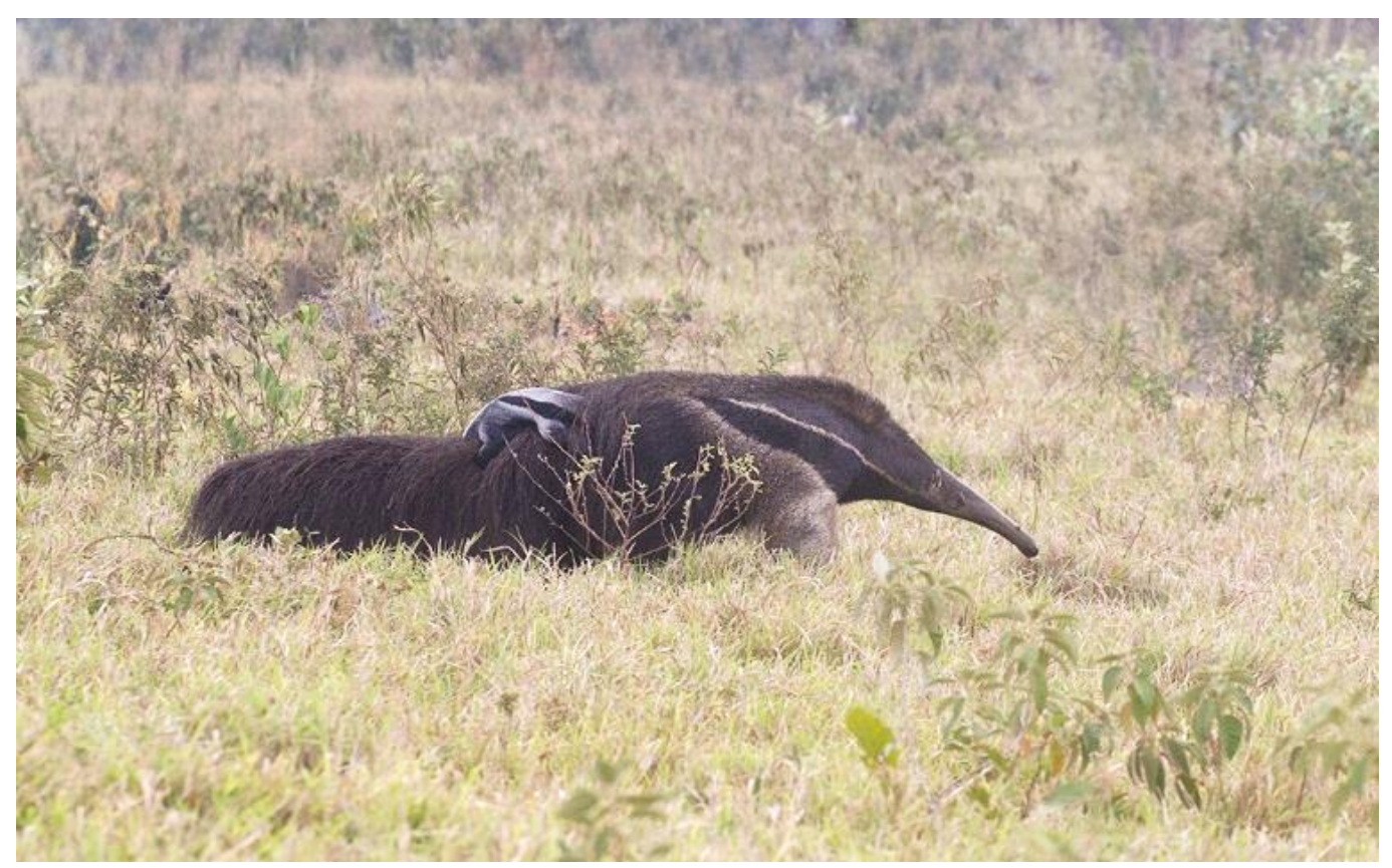
In our last minute we finally got to spot a Giant Anteater female and her baby.

After lunch we rode several hours in our van to the small tourist village of Bonito, where we would stay the night before visiting the Buraco das Araras (Macaws Sinkhole) the following morning. Along the ride we found even more Giant Anteaters to everyone's amazement, but tried not to stop too often as we wanted to reach our next lodge before day's end. However, we were already back to the paved road crossing ranchland in the Serra de Bodoquena hills when we finally spotted a mother Giant Anteater with a newborn baby on her back, and we simply had to stop. The baby was so small that its fur was still whitish rather than gray.