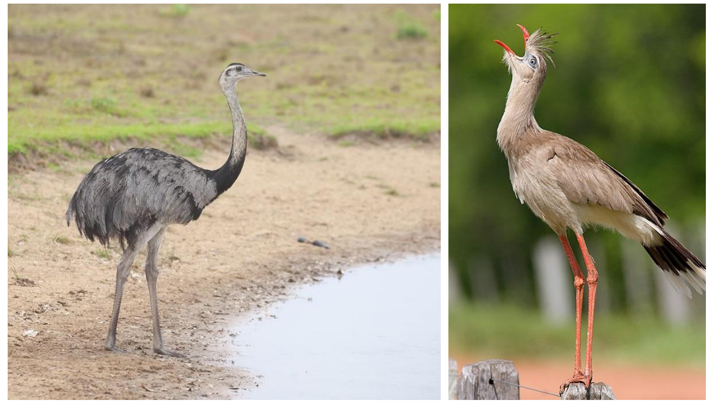
Along the road we saw Greater Rhea and Red-legged Seriema, two iconic birds typical of the Cerrado

Just a few kilometres along the dirt road we sighted the first Giant Anteater , but it was against the light, and we only enjoyed the animal moving along the open field going to the forest. Two more were seen in a far distance before we spotted one near the road in an open area, in great light providing our first good shots of this emblematic mammal. While we enjoyed the Anteater, four Hyacinth Macaws came out flying in the background. After that we kept moving along the road, in every single marsh area and forest edge we could see stunning birds such as: Snail Kites , Black bellied Whistling Ducks , Vermilion Flycatcher , Plumbeous Ibis , Buff-necked Ibis , Savannah Hawks , Nanday Parakeets , Toco Toucan , and so on.