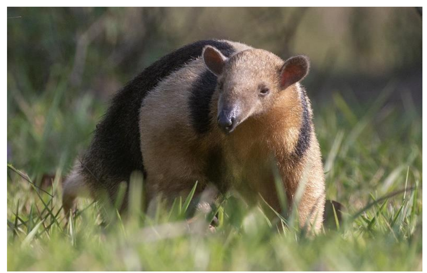
A nice surprise during our way to the first lodge in Southern Pantanal, Tamandua (Lesser Anteater) day time!

To our surprise we had yet another outstanding Giant Anteater sighting; we were returning to the van after getting some great images when we sighted a Lesser Anteater ( Tamandua ) that sent us back to the field to photograph one of the most difficult mammals to see during day time and on the ground no less, as they are mainly arboreal.