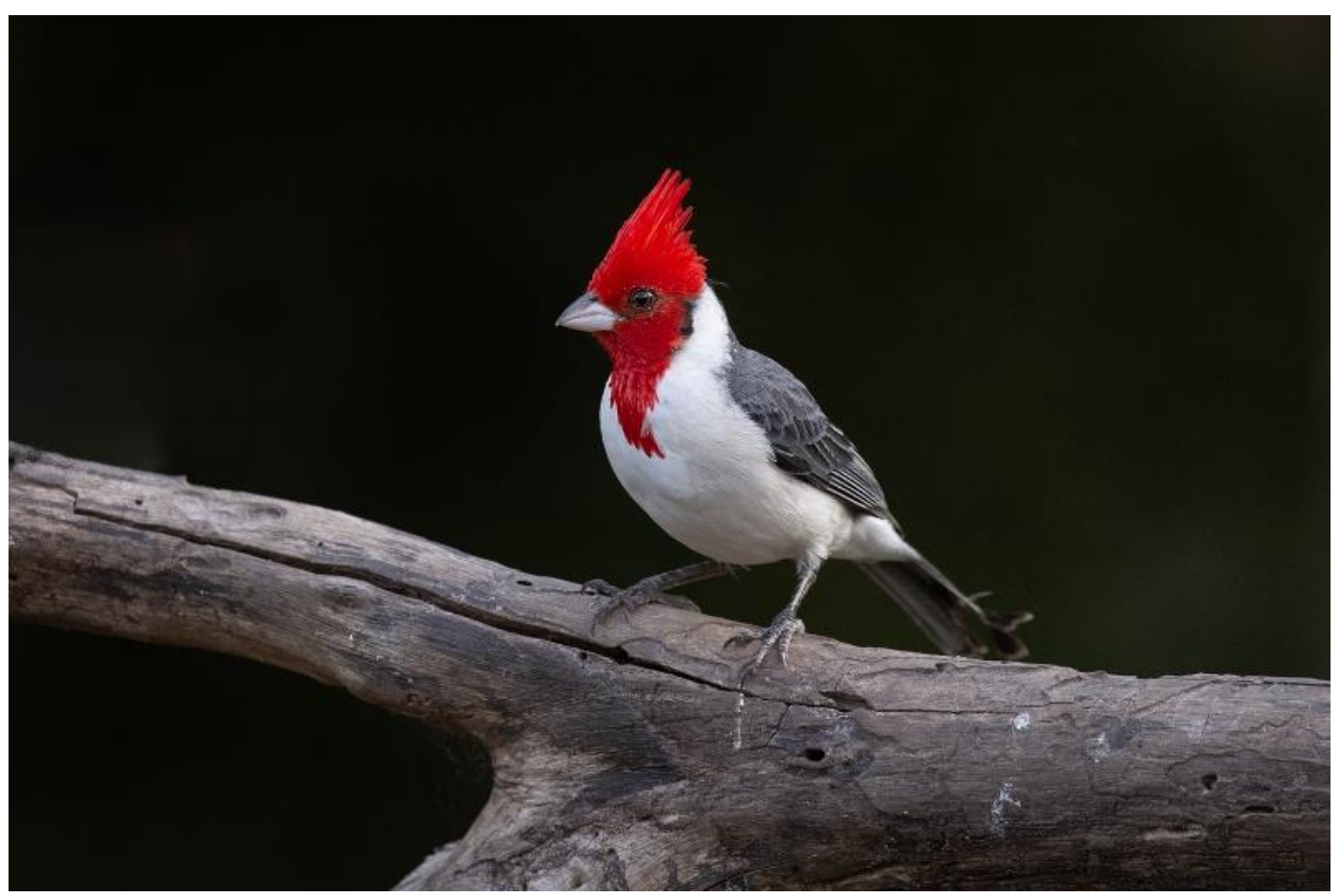
Red-crested Cardinal and other birds also visit quite often the bird feeder in front of the breakfast area

We always spend a few hours around the lodge photographing the birds at the feeder setups before we board our private safari vehicle to explore the lodge property. The property has about 4 thousand hectares and during the safari search for our targets to photograph. In the morning we got our first photos of the largest stork in