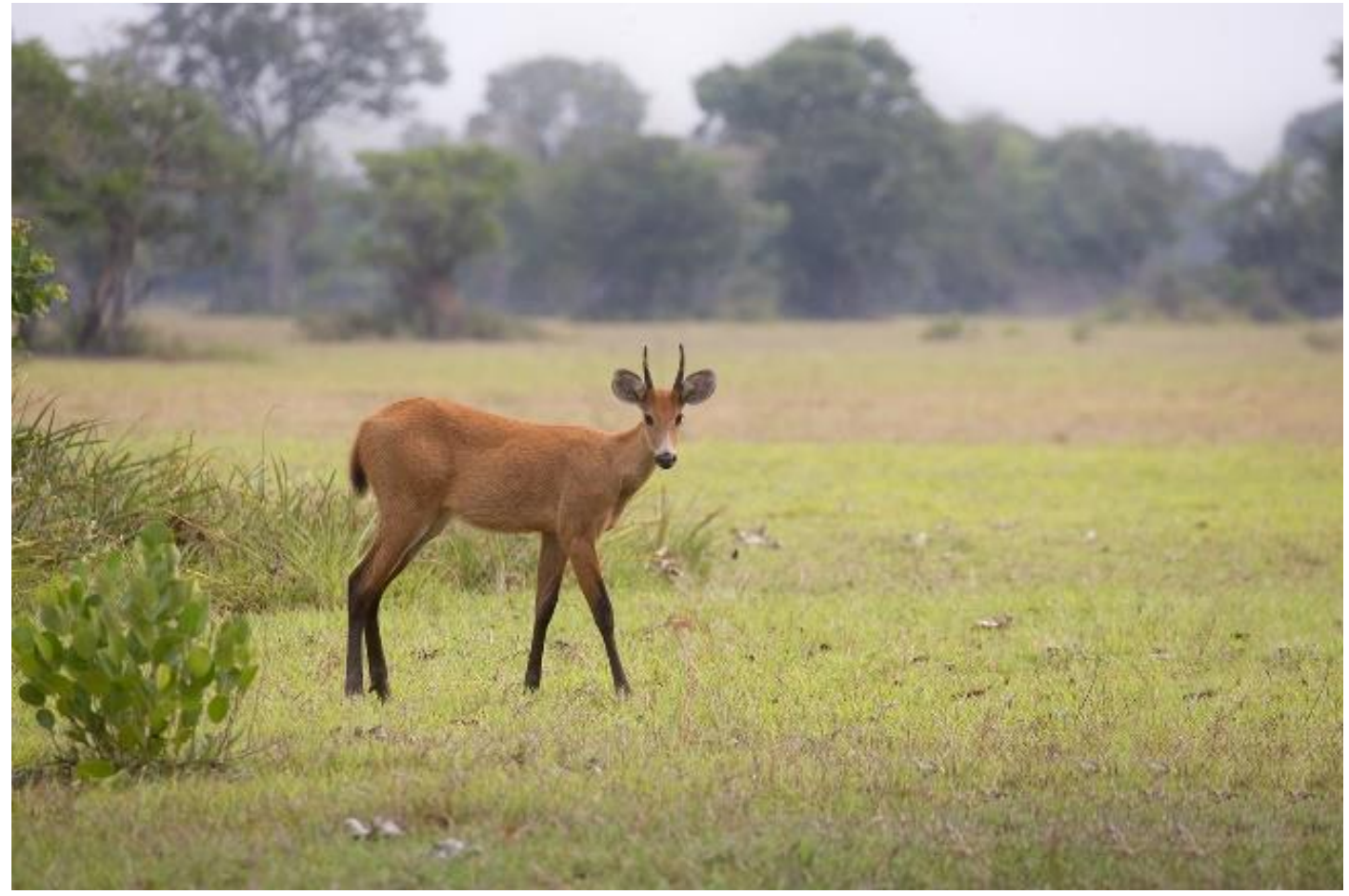
Marsh Deer, the largest deer in South America, seen quite often along the Tranpantaneira road.

Day 7 to Day 10 – In the following days, our main mission was to search for Jaguars. Nevertheless, the region, particularly the Encontro das Aguas State Park, exceeded our expectations on a daily basis. We had new bird species like Sunbittern , Pied Plover , Black Skimmer , Large-billed Tern and Yellow-billed Tern all along the river edges. The terns, skimmers and plovers were all actively nesting on the beaches and sandbars of the Cuiabá River. Slow cruises into narrower creeks and oxbow lakes found us more raptors, kingfishers and waders for our binoculars and camera lenses. Some great additions were Boat-billed Heron , Southern Screamer and Snail Kite . A wonderful element of our boat rides were multiple sightings of the impressive Giant Otters that entertained us for long periods as we watched their behaviour: swimming, hunting, grooming one another, and feeding on fish.