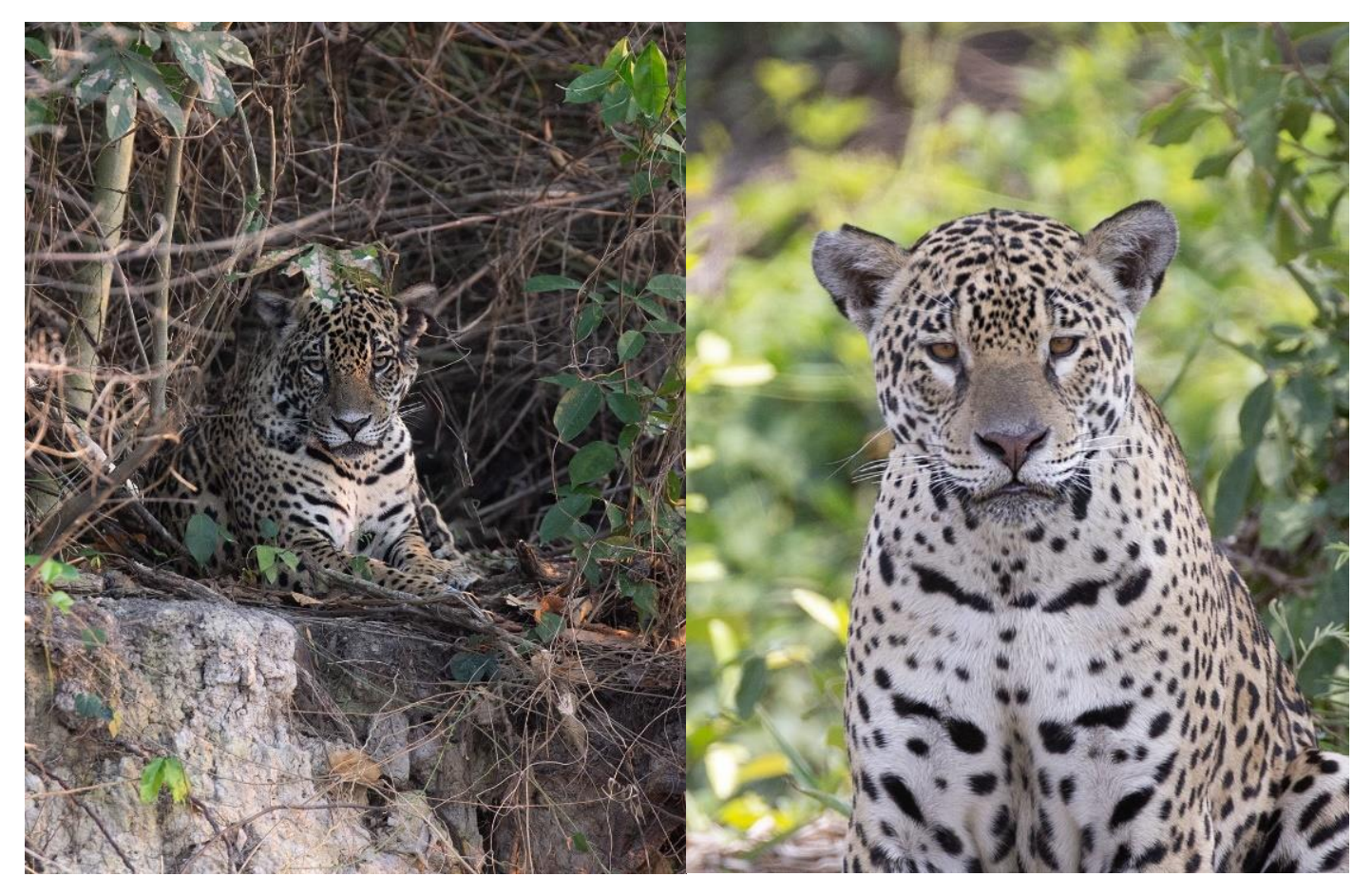
A big thank you to the whole group for a memorable trip to this fascinating region of Brazil!

However, the star attraction during our days on the rivers was the king of the Pantanal, the Jaguar and we had great sightings during every single boat trip we made. There is simply nowhere in the world better to observe and photograph these powerful apex predators than in the Encontro das Aguas State Park upstream from Porto Jofre. The name "Jaguarland" is well-earned! Our sightings were varied: we saw mothers and cubs moving along the shore, adults stalking the riverbanks looking for prey, cats chasing down caimans, and of course, jaguars laying down on the riverbank for a snooze, reminding us that cats are cats, no matter how big they get. Those days were really fantastic and memorable, and our three full days on in Jaguarland just flew by. Before we knew it, we were finishing up our final morning's boat ride before packing up and returning to Cuiabá, where we spent the night in a comfortable hotel near the airport and enjoyed a farewell dinner at a nearby churrascaria . Most of the group would continue to São Paulo the following morning to spend three days in the Atlantic Forest photographing the many colourful endemic birds in the montane forests of São Paulo state.