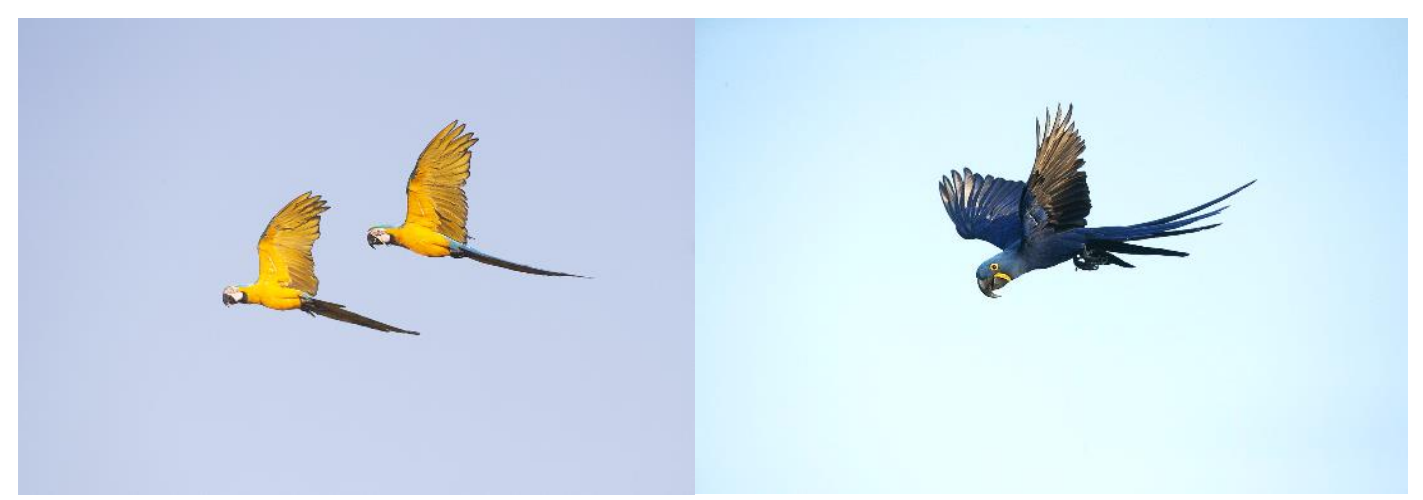
Blue-and-yellow Macaws and Hyacinth Macaws just around the lodge at Pousada Aguapé

Day 2 – The Southern Pantanal is rightly famous for its parrots, and Pousada Aguapé is truly a special place for them. Right around the lodge we see Hyacinth Macaw , Turquoise-fronted Parrots , Red-shouldered Macaw , Blue-and-yellow Macaw , Monk Parakeet and Nanday Parakeet . During breakfast we had great opportunities to photograph all those species flying around the lodge and at the lodge feeders. The feeder is also special for Toco Toucan , Purplish Jay , Plush-crested Jay , Red-crested Cardinal , Yellow-billed Cardinal , Chaco Chachalaca , Bare-faced Curassow , Shiny Cowbird , Screaming Cowbird , Giant Cowbird and Crested Oropendola .