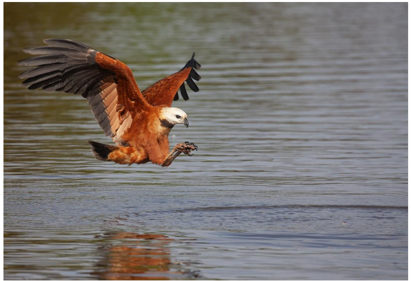
Black-collared Hawk in action, heading to catch a fish!