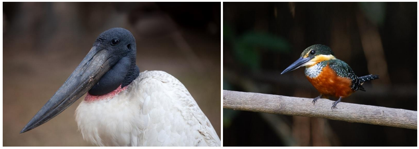
Jabiru and Green-and-rufous Kingfisher, two emblematic species seen on the Pixaim river