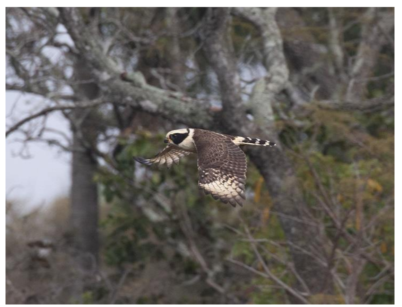
Laughing Falcon in flight at Buraco das Araras

Buraco das Araras presents a unique opportunity to shoot macaws in flight in three different levels: from above, from below, and at eye level. It can be a challenge, but the photographic rewards are well worth the visit. We spent the whole morning enjoying the show and photographing the macaws, and besides the Red-and-green Macaws , we also saw and photographed Curl-crested Jays , White-banded Mockingbird , Buff-necked Ibis , Laughing Falcon , Blue-and-yellow Macaw , and more. After a delicious lunch at a nearby restaurant, we headed to Campo Grande to overnight at a comfortable hotel in the city prior to our early flight to Cuiaba, the capital of Mato Grosso, for our section in the Northern Pantanal.