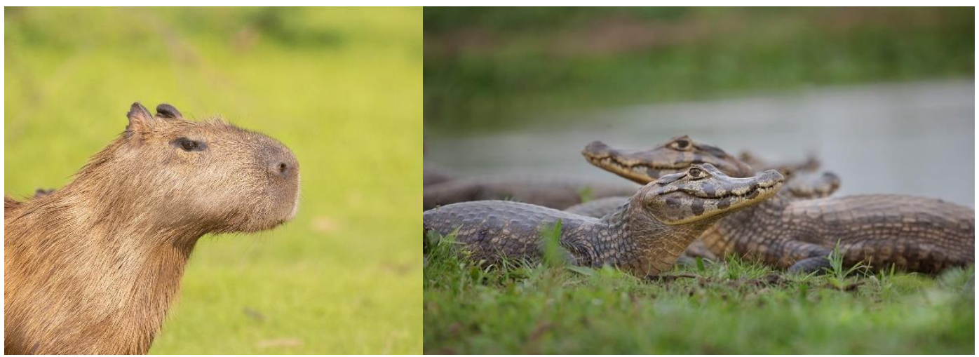
Capybara and Caimans seen during our last safari drive at Pousada Aguapé

Day 3 - In the morning after enjoying another couple of hours shooting around the lodge, we had our last safari truck drive to search for more Giant Anteaters, as the group was hoping to find a mother with baby in its back since we had already photographed the anteater in almost every other possible setting. We had some more great sightings of Giant Anteaters , but to our surprise, no babies. But we had more birds and mammals, such as Pampas Deer , Capybaras , Jabiru Stork , and so on.