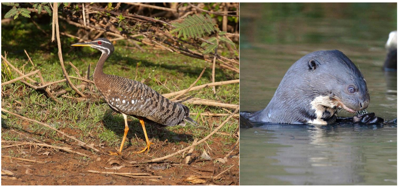
Sunbittern in the Piquiri river; Giant Otter eating a fish

Day 7 to Day 10 – In the following days, our main mission was to search for Jaguars. Nevertheless, the region, particularly the Encontro das Aguas State Park, exceeded our expectations on a daily basis. We had new bird species like Sunbittern , Pied Plover , Black Skimmer , Large-billed Tern and Yellow-billed Tern all along the river edges. The terns, skimmers and plovers were all actively nesting on the beaches and sandbars of the Cuiabá River. Slow cruises into narrower creeks and oxbow lakes found us more raptors, kingfishers and waders for our binoculars and camera lenses. Some great additions were Boat-billed Heron , Southern Screamer and Snail Kite . A wonderful element of our boat rides were multiple sightings of the impressive Giant Otters that entertained us for long periods as we watched their behaviour: swimming, hunting, grooming one another, and feeding on fish.