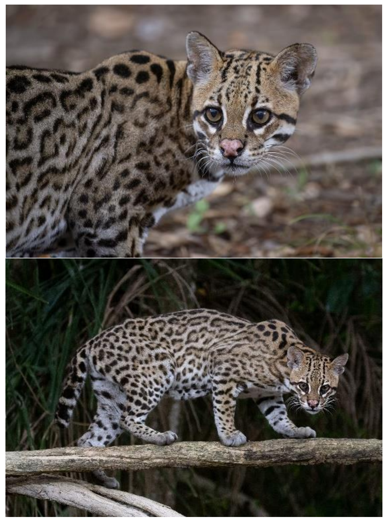
Two shots of one of the most elusive felines in the Neotropics, the Ocelot.

Day 6 – We woke up listening to the loud growling voice of the Black-and-Gold Howler Monkeys mixed with the raucous calls of dozens of Turquoise-fronted and Orange-winged Parrots that had been roosting in the trees along the Pixaim river. First thing in the morning we had time to climb up a tower to photograph a Jabiru nest at eye level, though some of the guests decided to shoot from the ground.