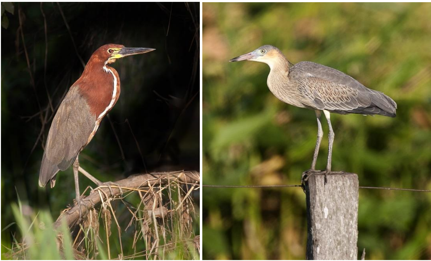
A couple of cool herons seen along the Transpantaneira road, Rufescent Tiger Heron and Whistling Heron

Day 5 – Our flight was uneventful and we arrived safely in Cuiabá, the busy capital of Mato Grosso state, Brazil's agricultural giant. We started things off here with lunch in a traditional Brazilian steakhouse known as a churrascaria . After lunch we drove 1.5 hours to the beginning of the Transpantaneira road, the most famous road in the entire Pantanal. The dirt road is lined with wildlife along its length, offering amazing photo opportunities all the way down. However, we had a mission to reach our lodge with enough time to visit a place to photograph the elusive Ocelot, so we couldn't linger as long as we might have wanted on the way. Along the Transpantaneira we saw a great variety of waterbirds: Green Ibis, Limpkin, Jabiru Stork, Wood Stork, Roseate Spoonbill, Muscovy Ducks, Black-bellied Whistling Duck, White-faced Whistling Duck, <b>Rufescent Tiger Heron, Cocoi Heron, Striated Heron . Beyond that, there were a few raptors along the road, such as: Black-collared Hawk, Crested Caracara, Savannah Hawk and Great Black Hawk .